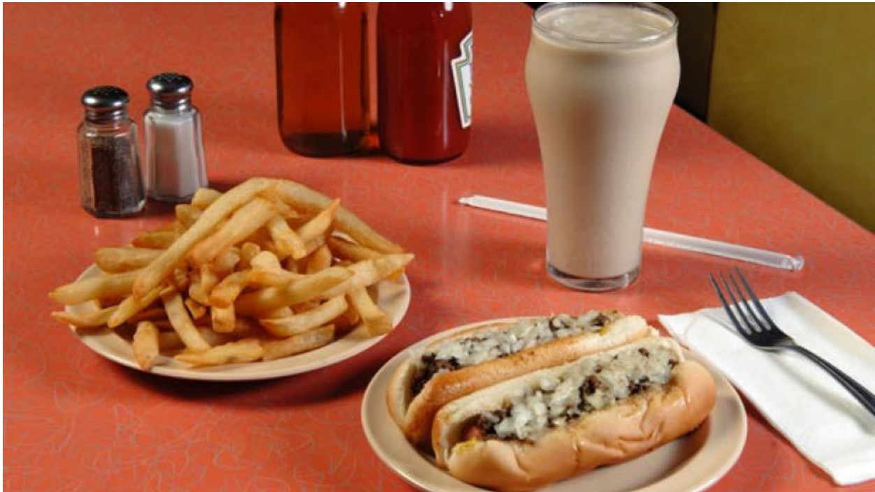
Olneyville N.Y. System

Olneyville N.Y. System, with three locations in Providence, North Providence, and Cranston, R.I., claims to serve "Rhode Island's Best Hot Wieners," and while that will always remain a point of contention, they're certainly the most legendary.